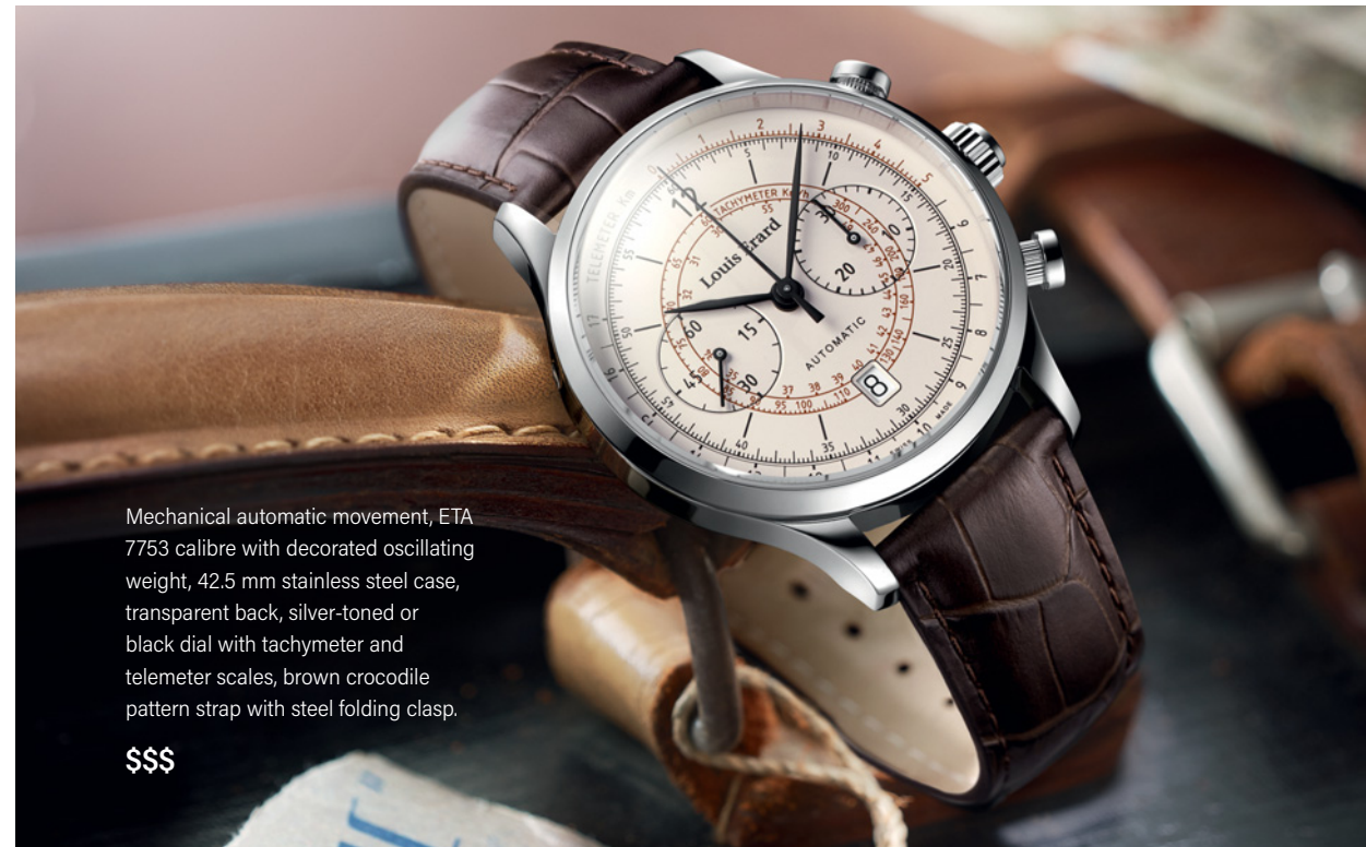
Mechanical automatic movement, ETA 7753 calibre with decorated oscillating weight, 42.5 mm stainless steel case, transparent back, silver-toned or black dial with tachymeter and telemeter scales, brown crocodile pattern strap with steel folding clasp.

Flashback to 1931 and the origins of the brand, when telemeter and tachymeter functions were in constant demand, and when chronographs marked time on two counters. Fast forward to 2017, and this creation is still bang on-trend. Volumes, curves, materials, colours and personalities haven't aged a day. Certain functions are simply assigned a more stylistic than practical role. The message is loud and clear: vintage is all the rage! Where else but the 1931 collection for this model? Automatic movement, 42.5 millimetre diameter, sapphire crystal with anti-reflective treatment on both sides to catch the eye, while the brown leather with crocodile pattern takes its cue from the originals. As does the dial whose chrono counters overlap the tachymeter and telemeter scales, placing the emphasis on functionality and legibility. This decidedly masculine timepiece will appeal to the urban adventurer who, now as then, expects his watch to deliver precision, elegance and modern style.