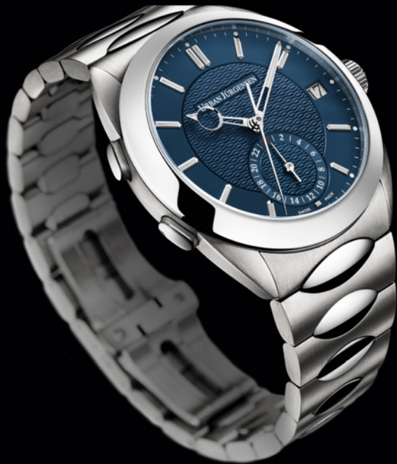
The Reference 5241 in Soft White, Charcoal Grey and Urban Blue