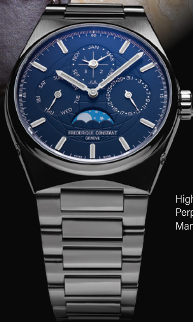
Highlife Perpetual Calendar Manufacture