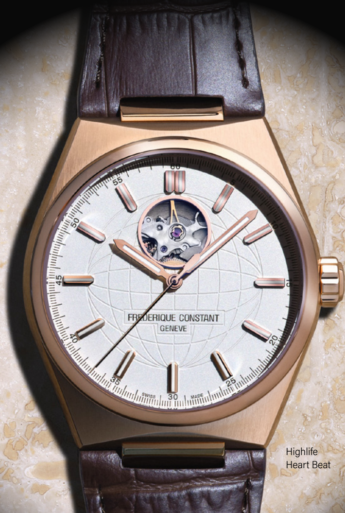
Highlife Heart Beat