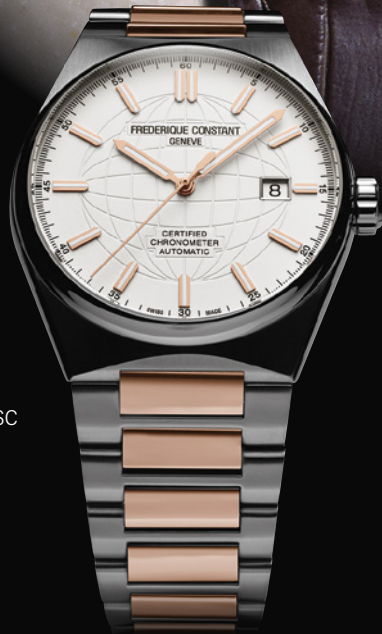
Highlife Automatic COSC